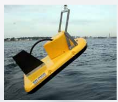
II SB-216S TOWFISH