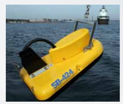
III SB-424 TOWFISH